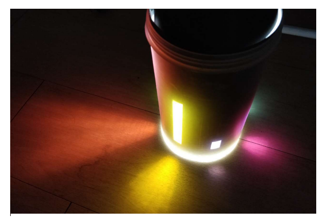
Data diary created by Shashank Jain in Fall 2019 that shows the time he spent on various activities in a week

Data diary (10% of final grade): This assignment addresses two important elements: that data surrounds us, and that storytelling with data is as much of an art as it is a science. Before we dive into best practices, we'll address the fun, creativity, beauty, and silliness that's instrumental to the field. Research and gather data about yourself on a topic of your choice and keep a data diary in Excel for a week. Examples include the music