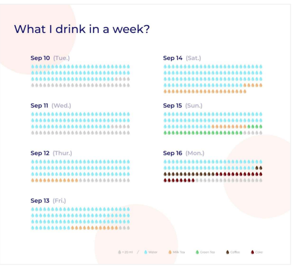
Data diary created by Ssu-Ting "Angie" Wang in Fall 2019 that illustrates the liquids she consumed in a week

you listen to, your phone app use, how much time you spend on coursework, how much media you consume and what kinds, etc. Build a data presentation to showcase what you've collected. Do not use Excel or Tableau to produce your final deliverable.